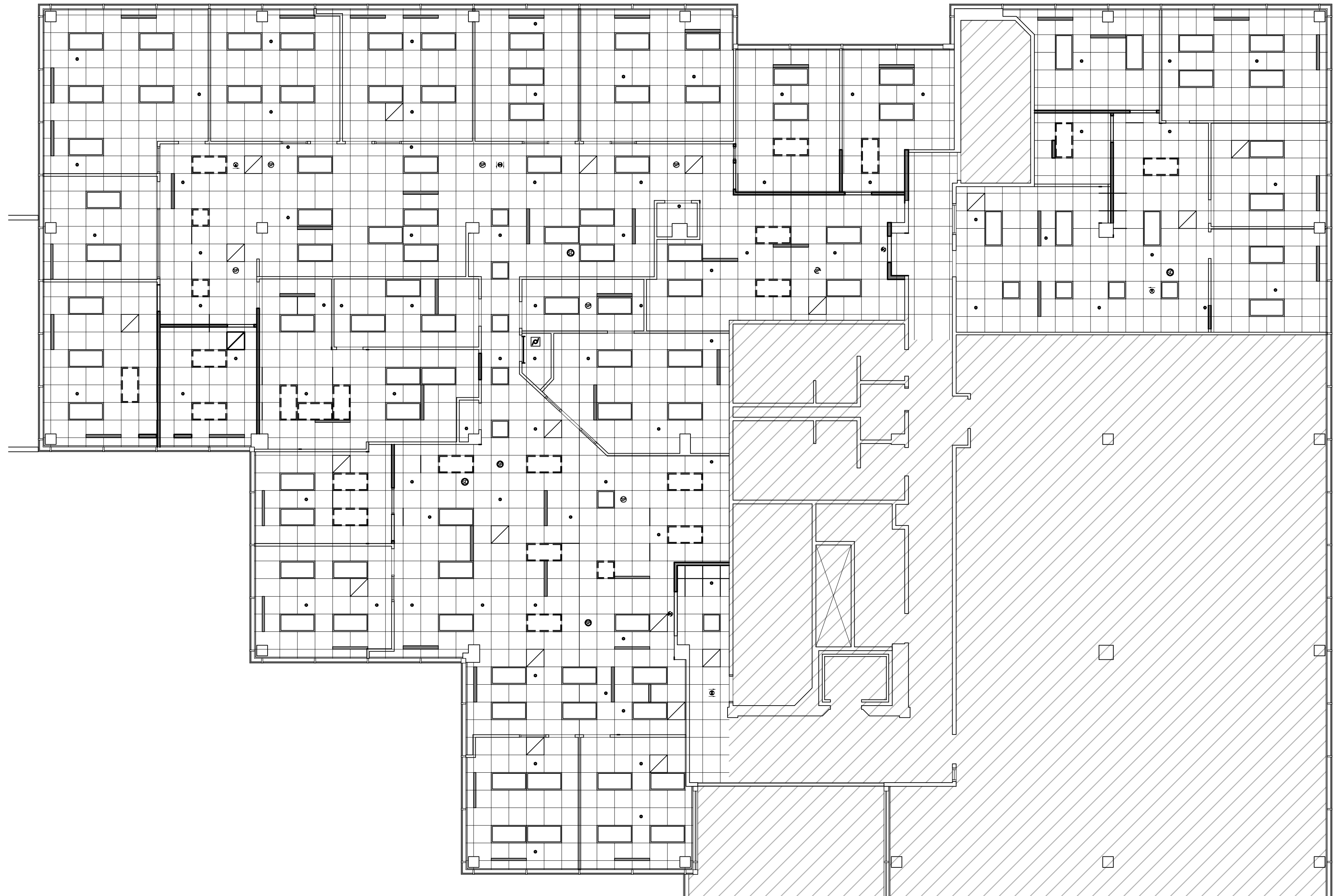
1 REFLECTED CEILING PLAN SCALE: 1/8"=1'-0"

EXISTING CEILING TO REMAIN UNLESS OTHERWISE NOTED PER PLANS. G.C. TO REPLACE TILES AND GRID AS REQUIRED